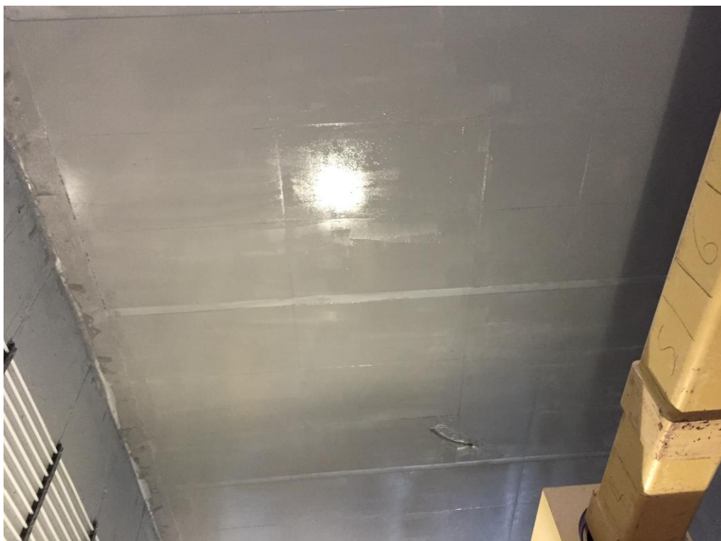
MAXURETHANE FLEX application